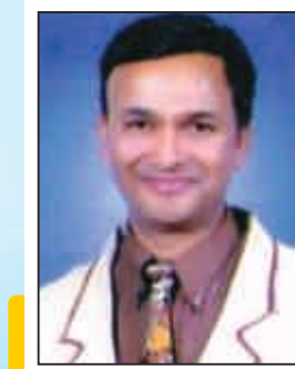
SIR ARVIND KANJILAL