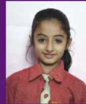
Taarika Class – 4 A