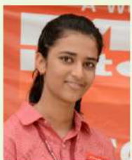
Naina Singh Sports Minister