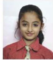
Taarika Class : 4 A

One, Two, Three Let India be pollution free Two, Three, Four No pollution anymore Three, Four, Five Remove this trouble hive Four, Five, Six Keep this agenda fix Five, Six, Seven Pollution free environment is heaven Six, Seven, Eight Kill this enemy straight Seven, Eight, Nine Let our breathing be safe and fine Eight, Nine, Ten We are eco-friendly men