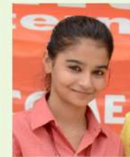
Shadma Sultan Cultural Minister