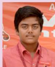
Aman Khan Sports Minister