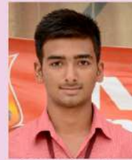
Avinash Choudhary Cleanliness Minister