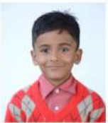
Lucky Class : 1 B

First grade, first day I'm not sure I want to stay First grade, first day I wonder if I'll get to play First grade, first day My teacher seems to be okay First grade, first day I hope i learn to read today.