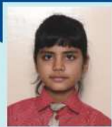
Asma Class : 5 A

A fish called obama ! Scientists have named a newly discovered maroon & Golden fish species, After the name of us president barack obama . It was found 300 feet Deep in the Water of kure atoll (island).